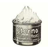
Sterno Canned Heat