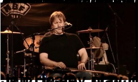
B.B. King - How Blue Can You Get (LIVE at Farm Aid 1985)