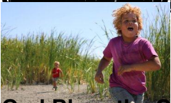
God Bless the Child (film)