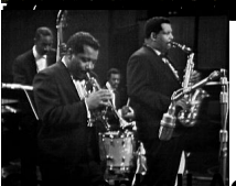
Cannonball Adderley Quintet