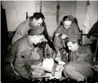
I'll Be Home For Christmas

Wednesday, 21 December 2011 20:21 - Last Updated Friday, 20 March 2015 17:51