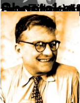
Dmitri Shostakovich - Violin Concerto No 1 - David Oistrakh